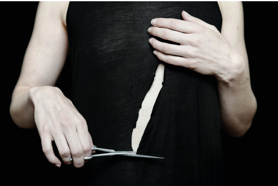
Photographs from the series : Territoire fragile