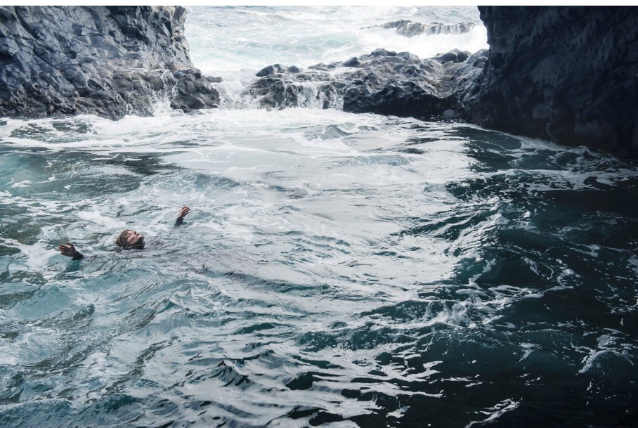
Photographs from the series : Motherhood