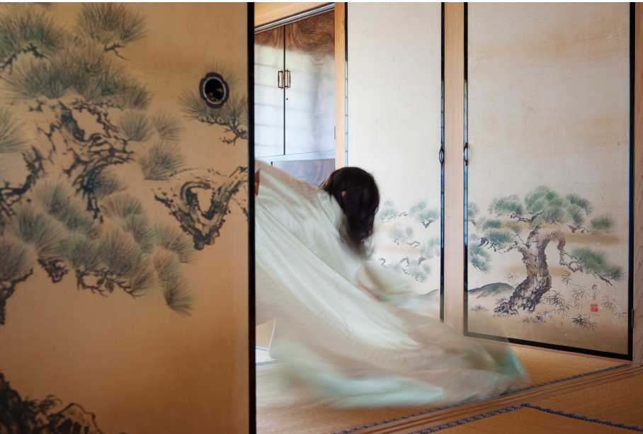
Photographs from the series : Homesick